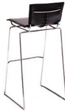
Pelle Kitchen Stool 135000

Frame: Tubular steel, polished chrome finish (CR0) Seat and Back: Saddle leather or Demi leather, black leather lacing on back Saddle leather options: Natural (NTL), tea (TEL) or black (BKL) Demi leather options: Natural (NTV), tea (TEV) or black (BKV)